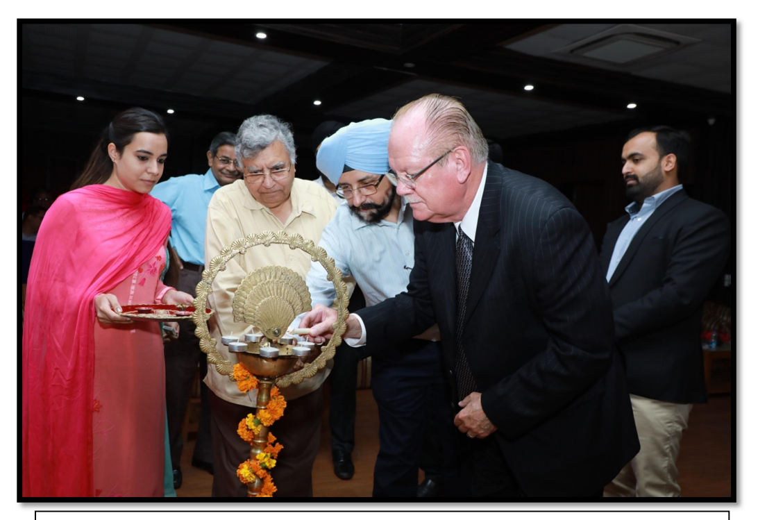
Lamp Lighting by the Dignitaries