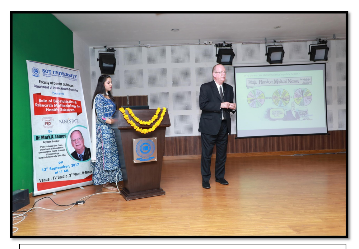
Guest Lecture by Speaker on "Role of Biostatistics & Research Methodology"